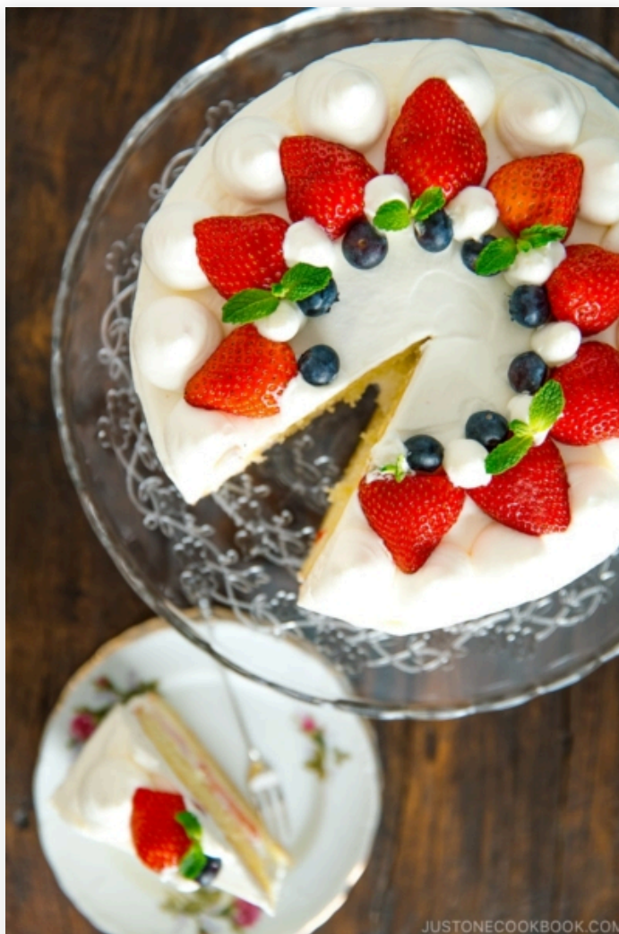
Japanese Strawberry Shortcake いちごのショートケーキ