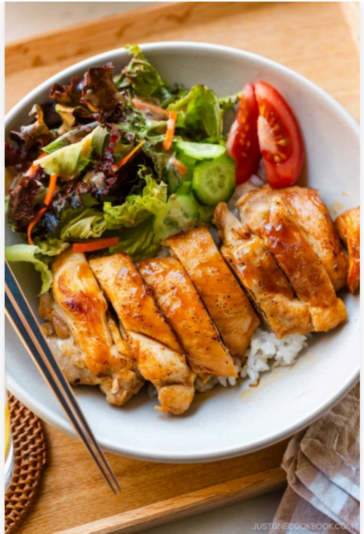
Chicken Teriyaki (Video) チキン照り焼き