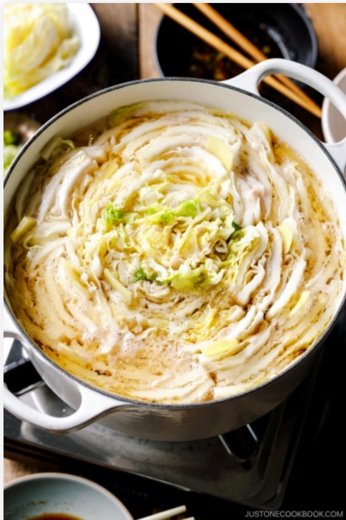
Mille-Feuille Nabe ミルフィーユ鍋