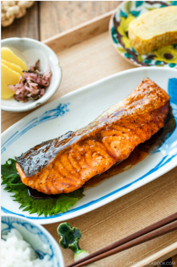
Teriyaki Salmon (Video) 鮭の照り焼き