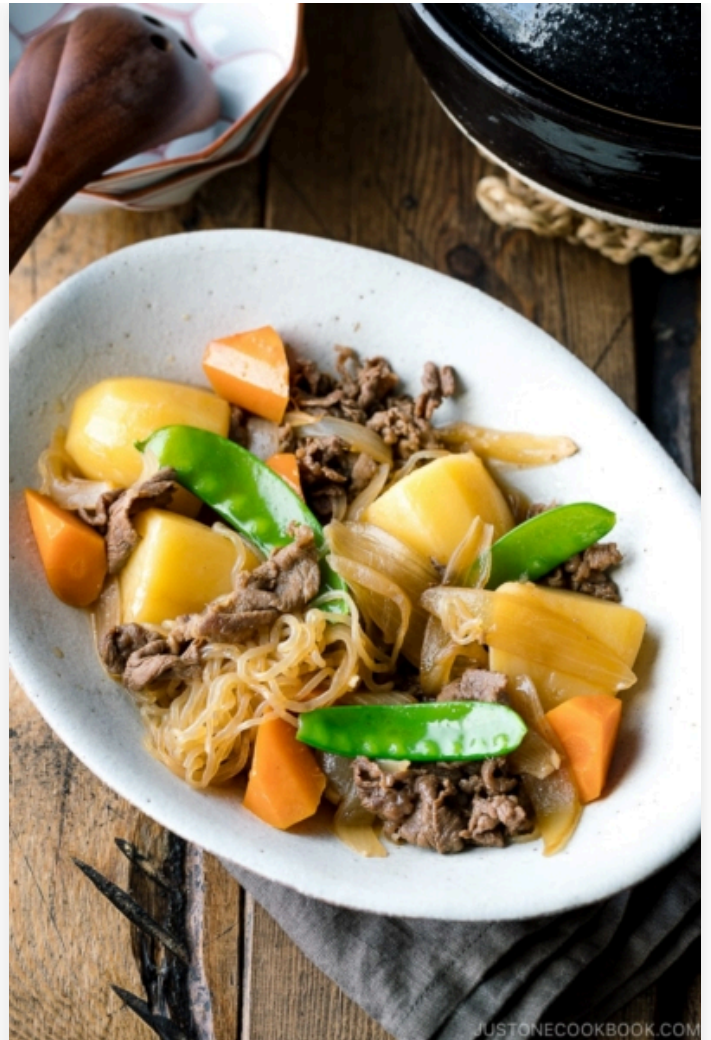
Nikujaga (Japanese Meat and Potato Stew) (Video) 肉じゃが