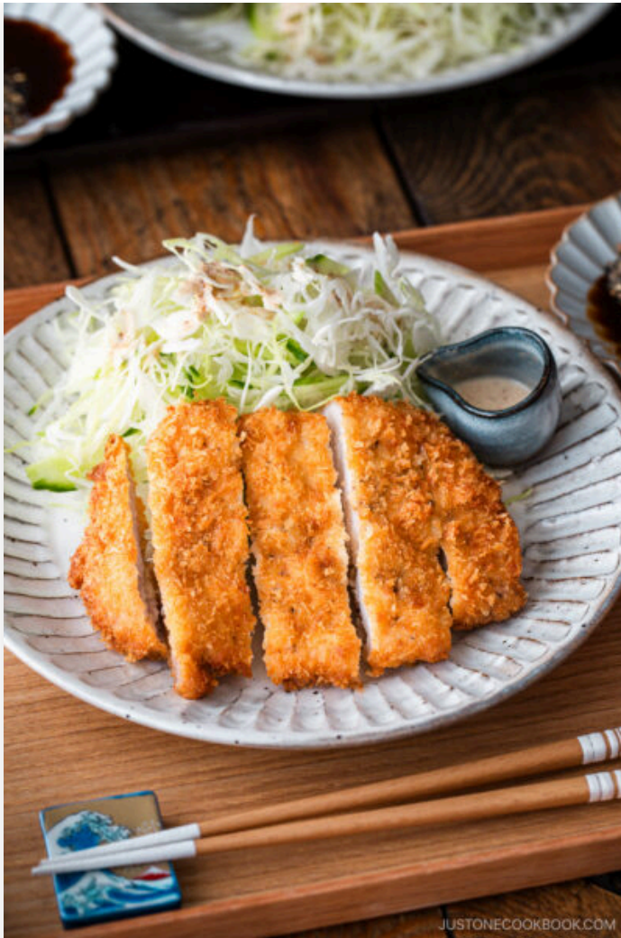
Tonkatsu (Japanese Pork Cutlet) (Video) とんかつ