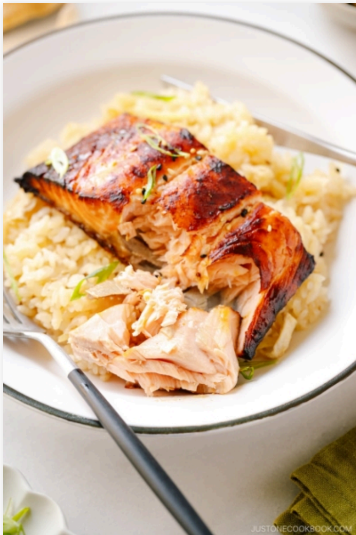
Miso Salmon (Video) 味噌サーモン