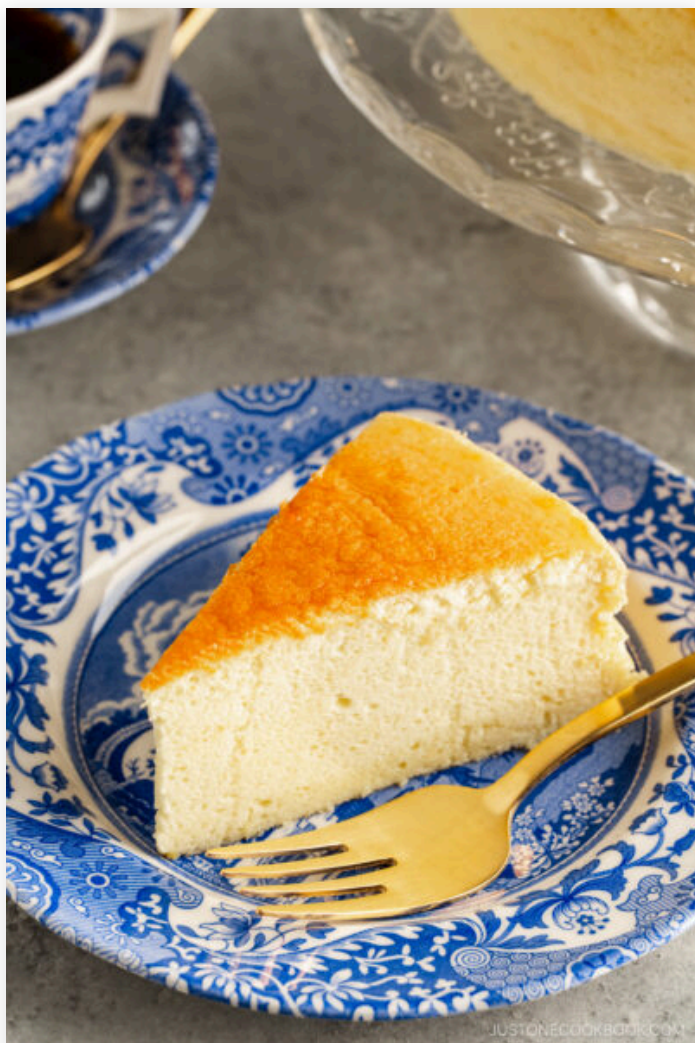
Japanese Cheesecake (Video) スフレチーズケーキ